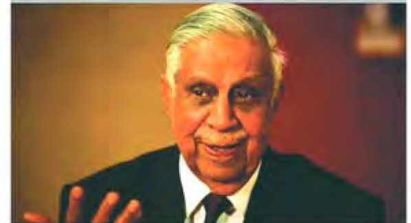
Mr. Justice M.N. Venkatachaliah Former Chief Justice of India

“ I have great pleasure in commending to all Institutions, particularly Corporates and other public spirited persons interested in the welfare of society, to participate in this exciting experiment of bringing justice between man and man in a society which is tending more and more towards strife and friction. ”